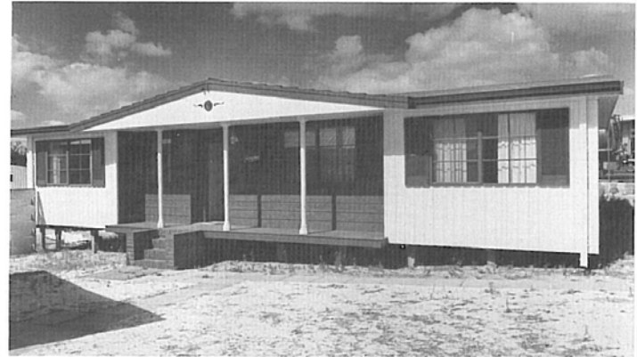
Georgina: Three-Bedroom Transportable Home