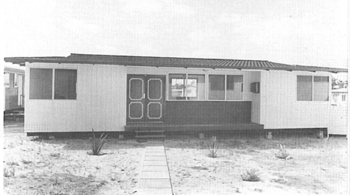
Warwick: Three-Bedroom, Two-Bathroom, Transportable Home