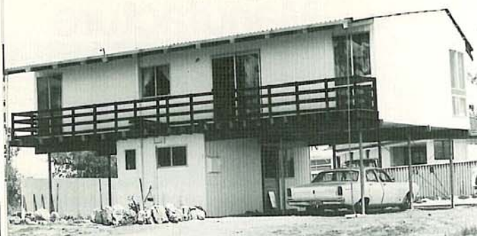
Oceana: Pre-cut Four-Bedroom Holiday Home