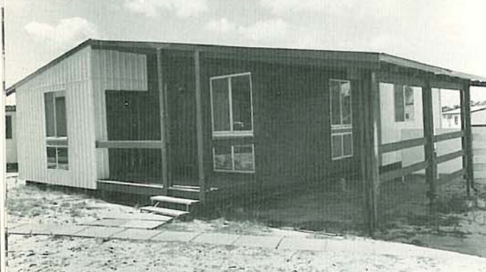
Essex: Three-Bedroom Transportable Home