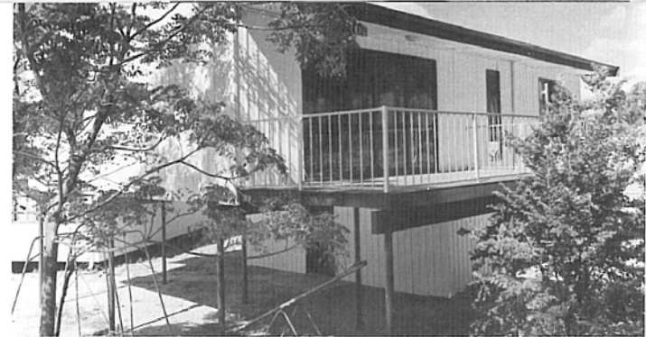
Ebb Tide: Three-Bedroom Holiday Home