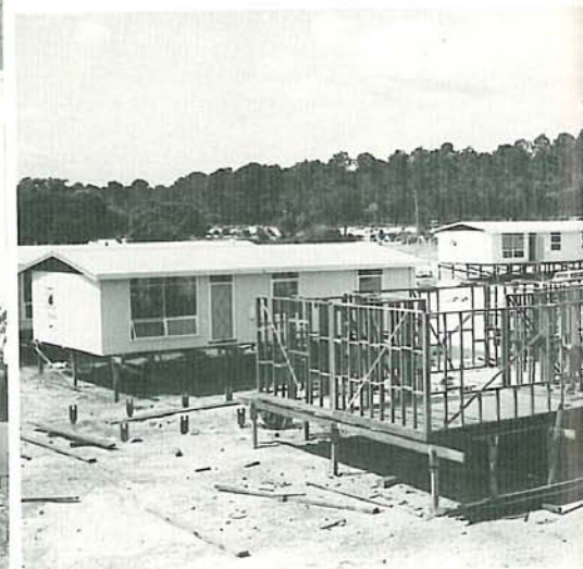
Section of Transportable Building Construction Yard.

To meet this demand ALCO has a production complex at Melville where it manufactures two, three and four-bedroomed homes, schools, shops, offices, churches, hospital units, once even a gaol. These are transported to sites, sometimes thousands of kilometres from Perth. The buildings are constructed with either timber, steel or aluminium frames and are clad in asbestos cement, timber or simulated brick.